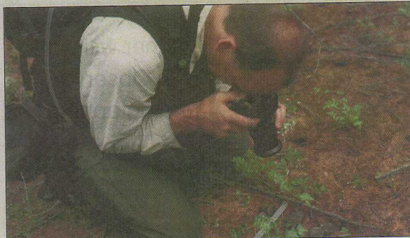
EVIDENCE: Photographing and measuring wolf droppings. As well as species of primary interest – snow leopard, ibex and argall – the expedition was also on the look out for signs of other animals such as marmot, manul, wild boar, lynx, bear and wolf.