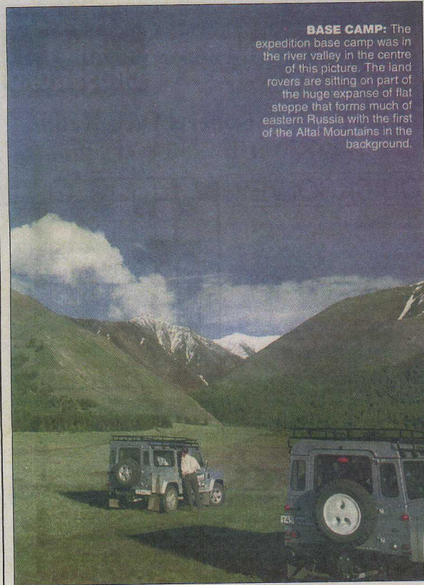
BASE CAMP: The expedition base camp was in the river valley in the centre of this picture. The land rovers are sitting on part of the huge expanse of flat steppe that forms much of eastern Russia with the first of the Altai Mountains in the background.

The final rail section was on "Train 26", the famous Trans-Siberian Express, for the 2000-mile journey across the flat, Russian steppe to Novosibirsk to meet the other expedition members. Base camp in the Altai