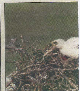
STEPPE EAGLE EYRIE: These of plenty of prey in the area. As part work of the Siberian Environment feathers for DNA analysis