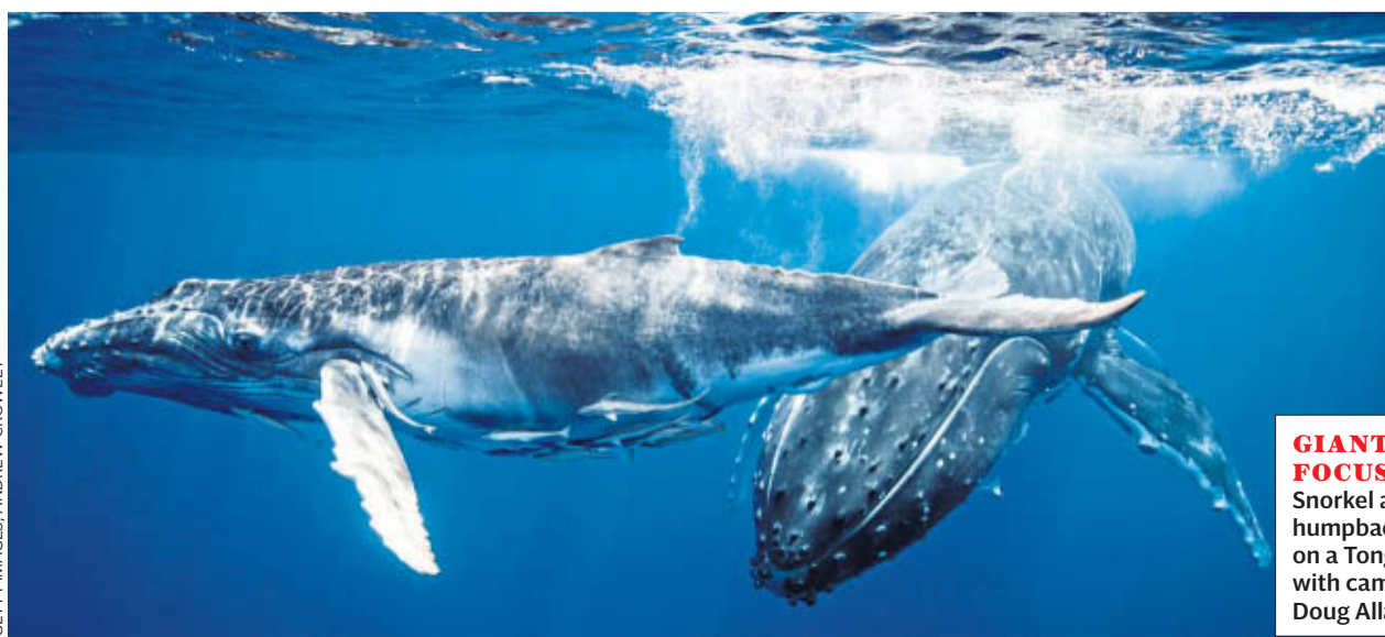
GIANTS IN FOCUS Snorkel alongside humpback whales on a Tonga cruise with cameraman Doug Allan