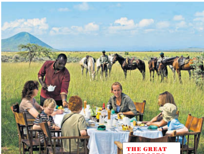
THE GREAT OUTDOORS Family breakfast at Chyulu Hills, Kenya, above; hot-air balloons over the Maasai Mara, right