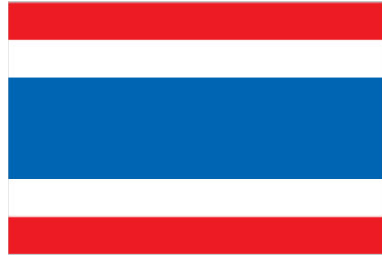
Figure 1.2a. Map and flag of Thailand with study site (red dot).

An overview of Biosphere Expeditions' research sites, assembly points, base camp and office locations is at Google Maps .