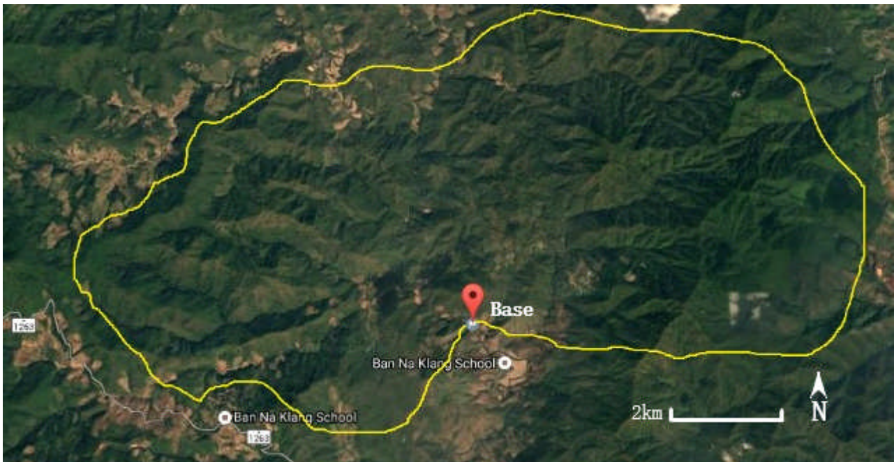
Figure 2.2a. Topographic map of study site, located inside the yellow line. For location of site in Thailand, see Fig. 1.2a.

The study site is described in chapter 1.2. and a topographic map of the site is in Fig. 2.2a.