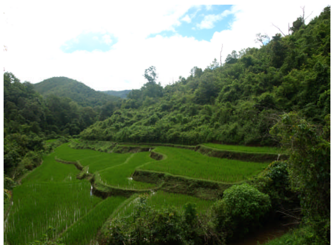
Figure 2.2c. Pictures of the agricultural areas and forests expedition participants trekked through to reach the elephants each day.