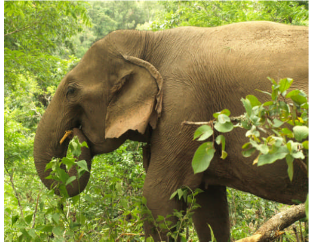
Figure 2.2b. Pictures of the four elephant study subjects. Top left: Boon Rott. Top right: Gen Thong. Bottom left: Mae Doom. Bottom right: Too Meh.