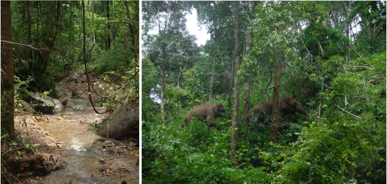
Figure 2.2d. Two examples of the areas the elephants roam in. Left: In a rocky river bed. Right: On a steep forested slope.

Data collection started at 8:00 and ended at 16:00, and was split into one hour periods, with the aim of collecting data sets (activity budget, elephant foraging and elephant association) simultaneously.